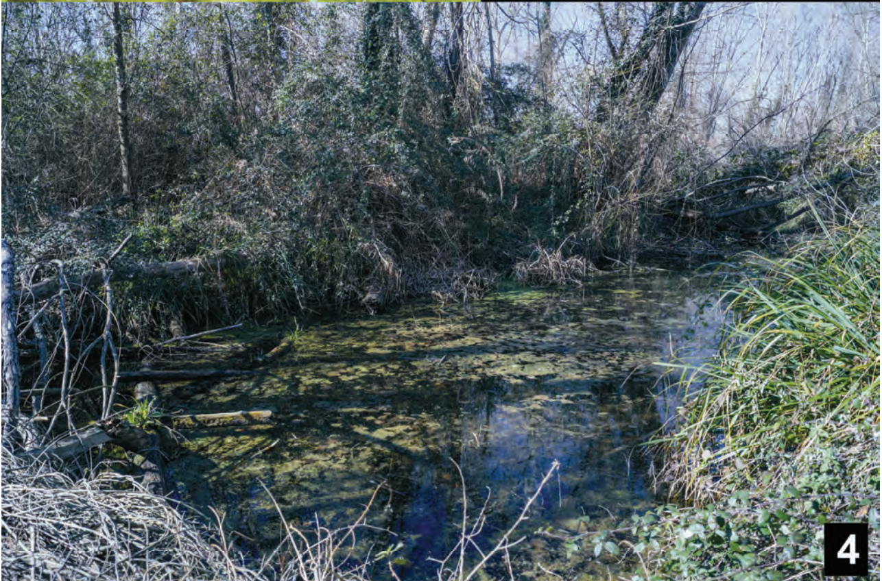
Fig. 1-3. Dolomedes plantarius . 1-2. Habitus. 3. Male palp. 4. Deveses de Salt, Girona, Catalonia, NE Iberian Peninsula.